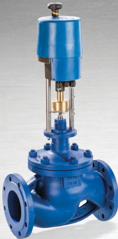
BOA-H Mat E