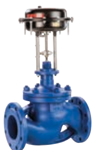
BOA-H Mat P