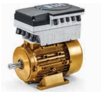
KSB SuPremE® motor 7,5 kW