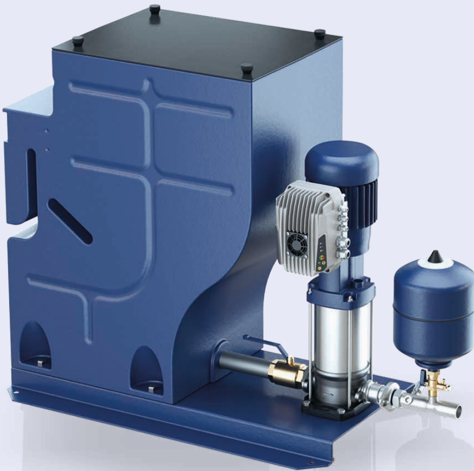
KSB Safety Boost MVP