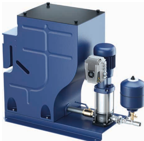
KSB Safety Boost MVP