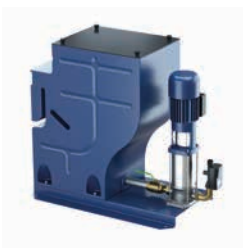
KSB Safety Boost 1/0608