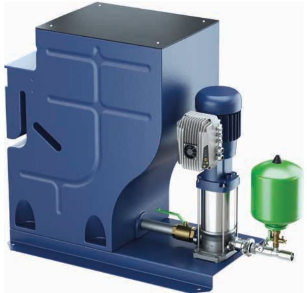
KSB Safety Boost MVP