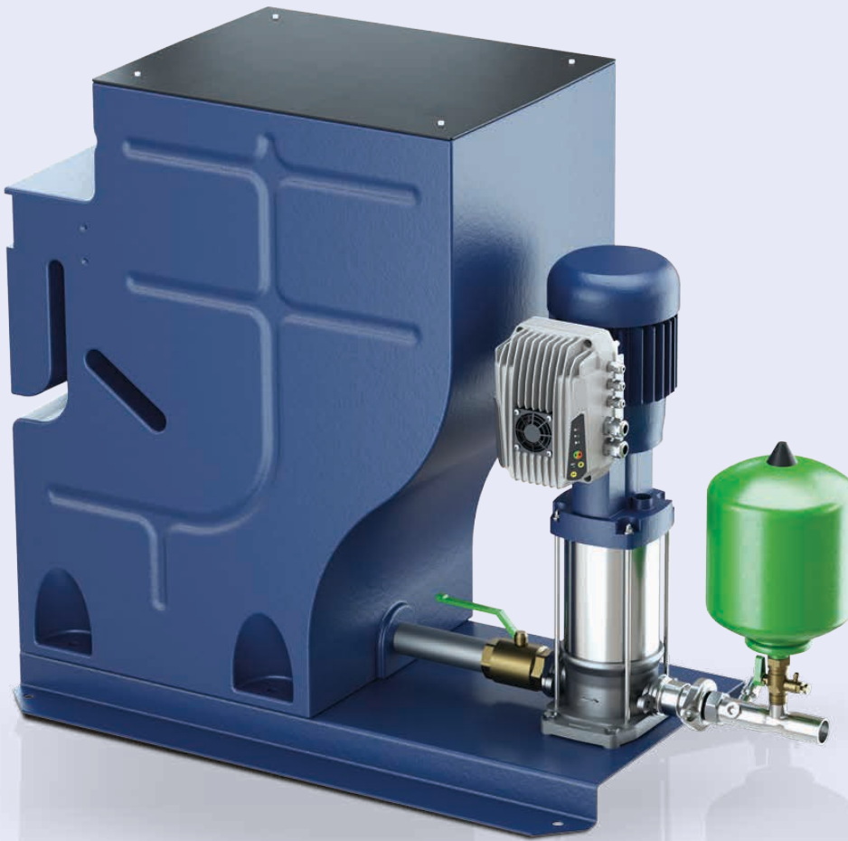
KSB Safety Boost MVP