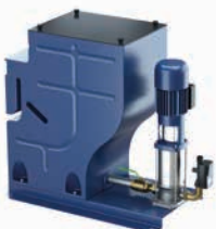
KSB Safety Boost 1/0608