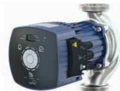
CalioTherm Pro screw-ended