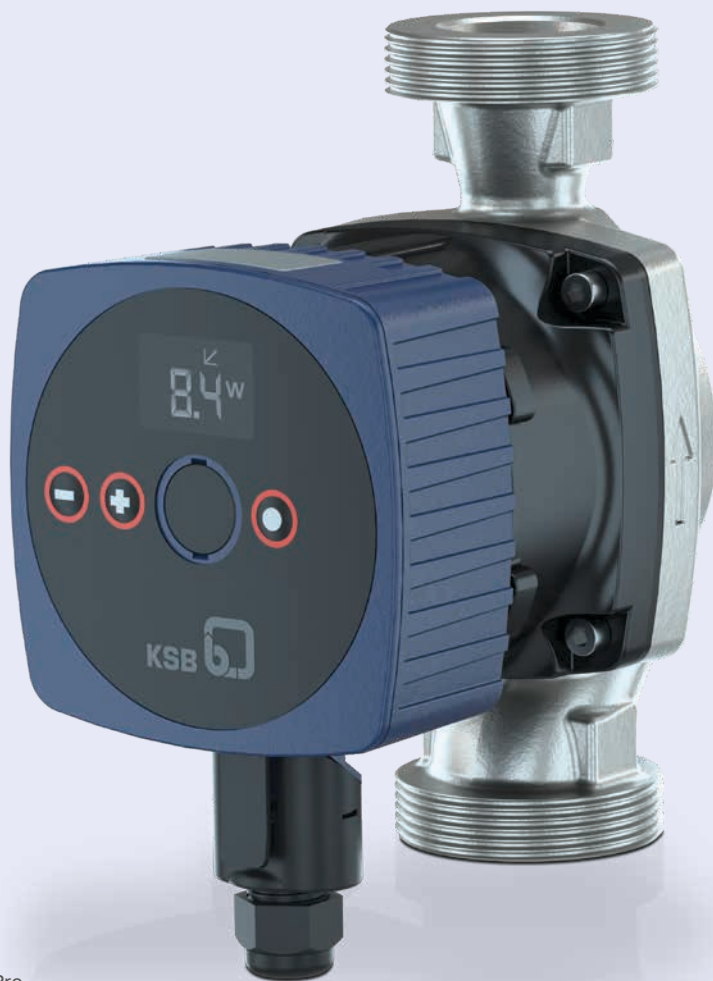
CalioTherm S Pro

Drinking water circulation systems in single-family houses