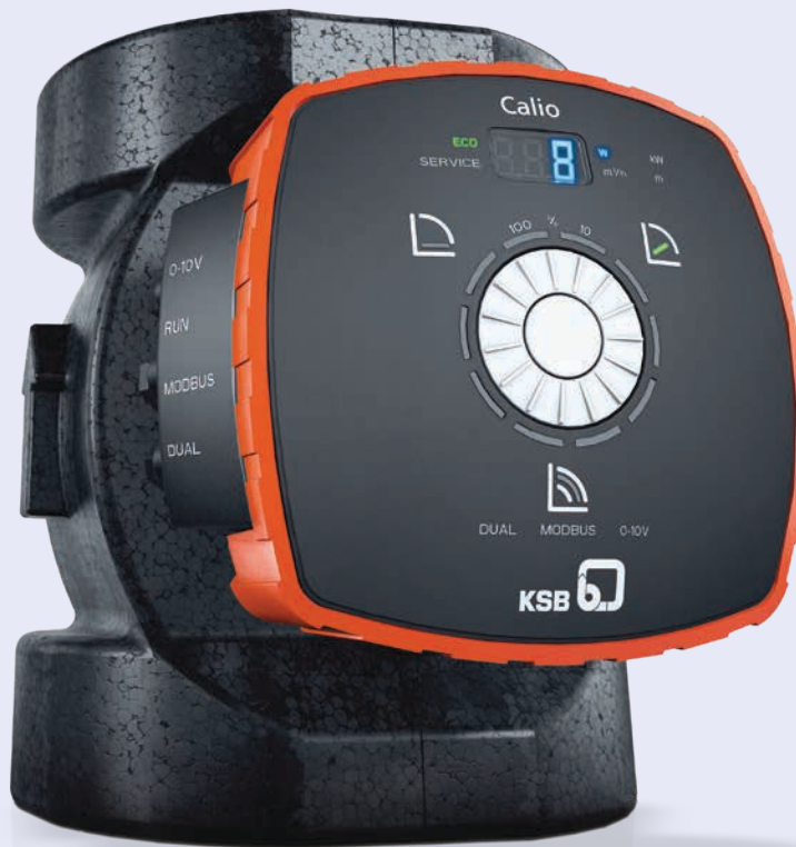
Calio with thermal insulation