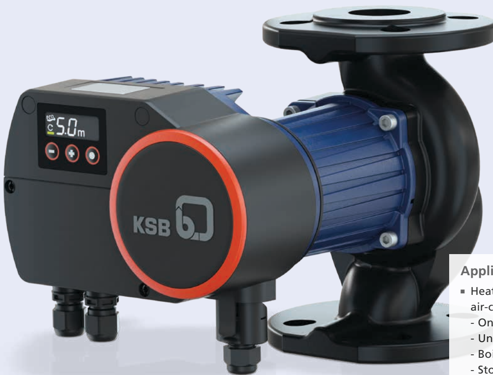
Flanged Calio Pro