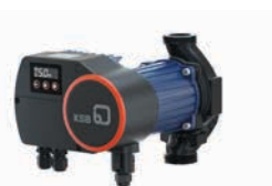
Calio Pro – screw-ended