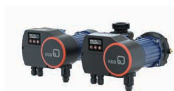
Calio Pro Z – screw-ended twin pump