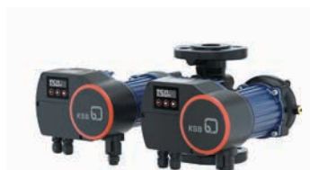
Calio Pro Z – flanged twin pump